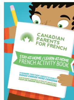
FRENCH ACTIVITY BOOKS